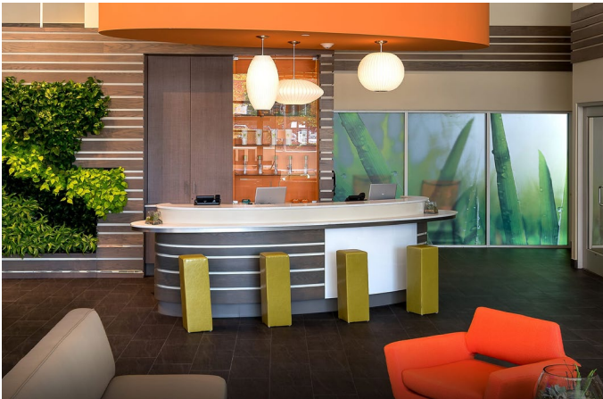
EVEN HOTELS – STRUCTURE & STYLE

rooms in different buildings and even on different floors of the same building. Luckily, we could draw on the insight and expertise of the Even Hotels team. They helped our designers and engineers understand every aspect of their business. And finally, we had to design a functional trainer that could be manufactured with efficient repeatability.